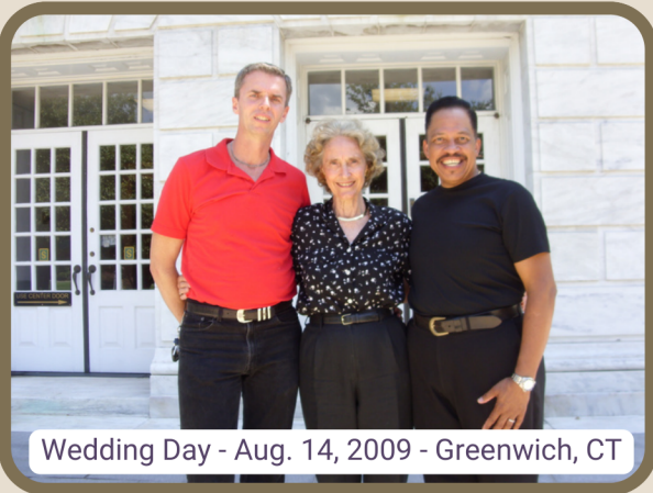
Wedding Day - Aug. 14, 2009 - Greenwich, CT

I respond, “I’m a white man married to a Black man? How do you think I vote?” We then can have a healthy discussion about how our own values should help us make an informed decision about which candidate will best represent us, which is why a candidate that is not forthcoming on where they stand should send up alarm bells with the electorate.